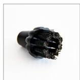
RIP5221 Small brush ø25mm M10 - PVC