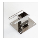
COF5068 Wall bracket for steam gun