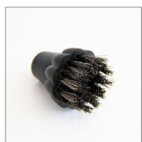
RIP5222 Small brush ø25mm M10 - St.Steel