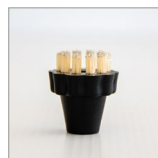
RIP5224 Small brush ø25mm M10 - Pekalon