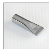
RIP5226 Chromed flat nozzle M10